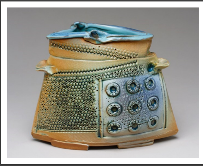
Tread #3 , by Sandy Blain